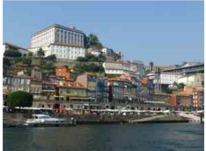
Cruise along the Douro River, passing under some of Porto's famous bridges and taking in the sites of the city from the river.