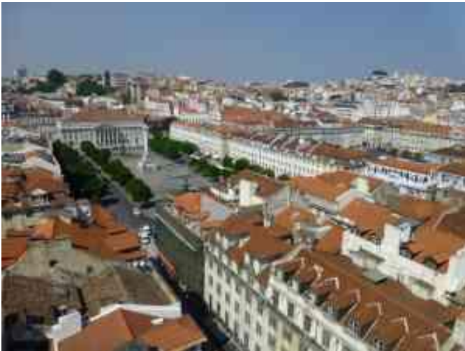
Tour the fascinating city of Lisbon visiting Park Edward VII and the Jeronimus Monastery, and of course tasting a traditional Portuguese tart at Antiga Confeitaria.