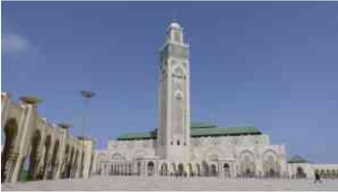
Admire Casablanca's glittering Hassan II Mosque, the largest in Morocco and second-largest in the world.