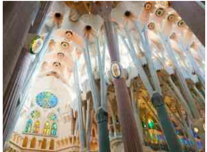
Admire Gaudí's masterpieces in Barcelona, including the unfinished masterpiece of La Sagrada Família and Park Güell.